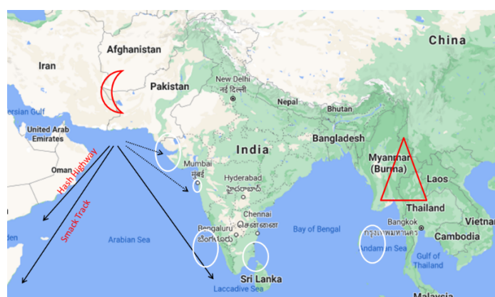
Figure 2: Trafficking Areas and the Southern Route

Heroin and hashish manufactured in the regions referred to as the Golden Crescent and Golden Triangle are smuggled farther to the United States of America and Europe via India's borders. Several rebel organisations with bases in Afghanistan, Sri Lanka, and North-Eastern India engaged in the drug trade to make money to buy munitions from South-East Asia for their upkeep. Historically, the most vulnerable area has been the border between India and Pakistan for the illegal drug trade, it is evident that since the 1980s, Sri Lanka has grown to be a major hub for drug transportation.